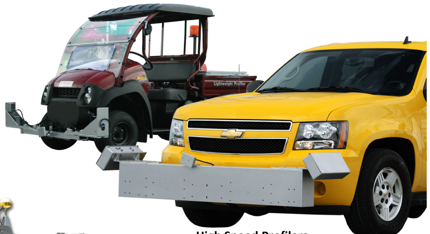
High Speed Profilers